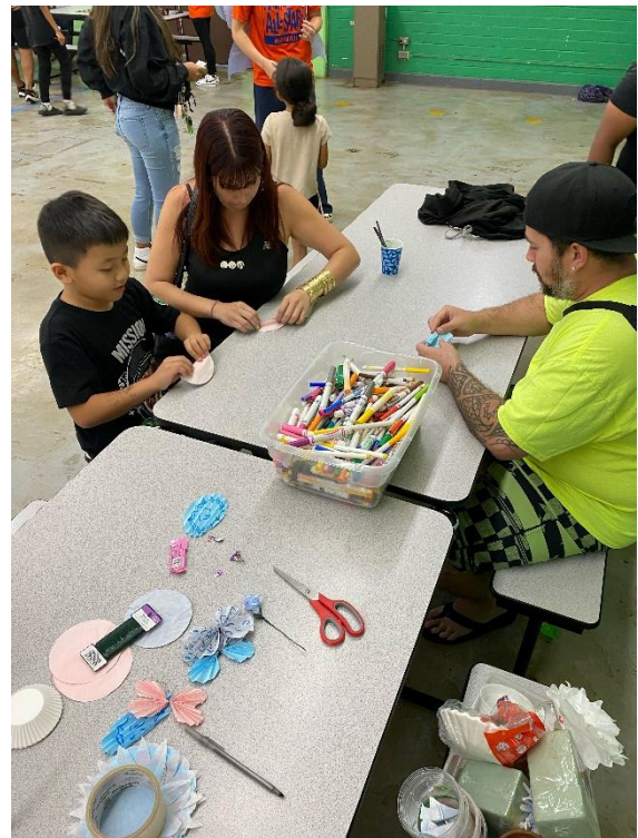
Q3 Hoike was a success with families and students enjoying the ramen bar, creative and interactive booths, and prize give-aways.