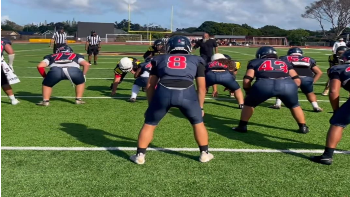
Tackle football season starting with a scrimmage at Mililani high school stadium for our Jr.Searider's football.