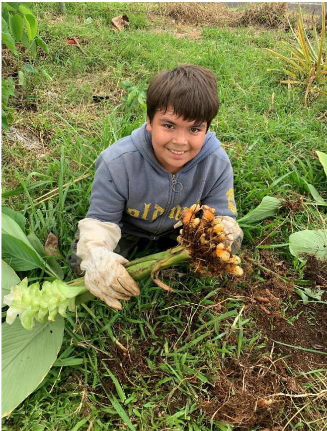
Green Thumb Gardening working hard harvesting turmeric and enjoying the fruits of their labor in our well-loved garden.