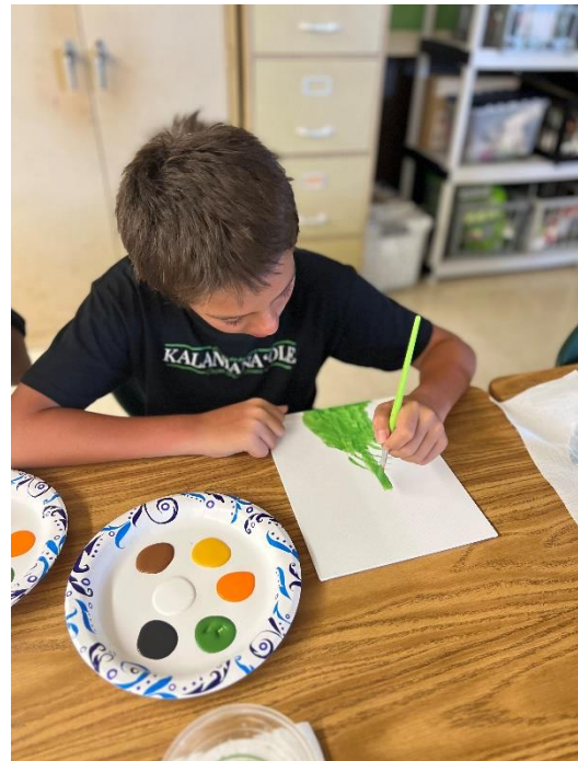
Mix Media Art Class practicing their Van Gogh flowers and expanding their artistic capabilities.