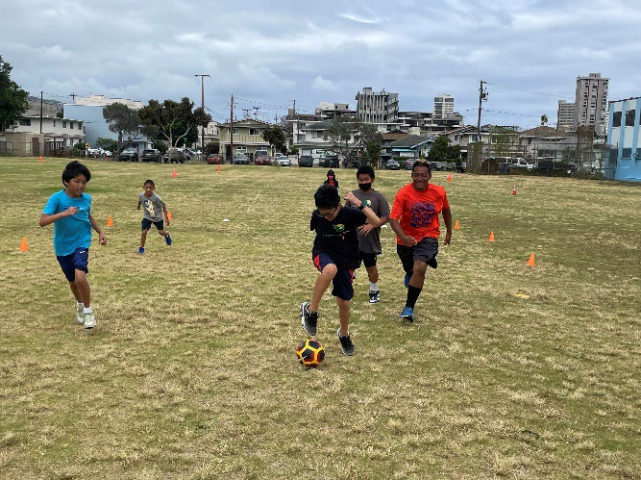
We brought back soccer class for the summer, and the students have taken the drills and games in their stride.