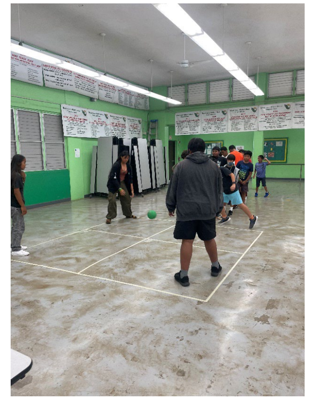
Multi-sports brought back some playground classics such as kickball and 4-square.