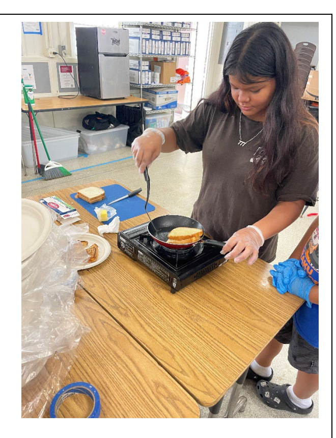
Cooking Class is learning how to make nutritious meals on a budget.