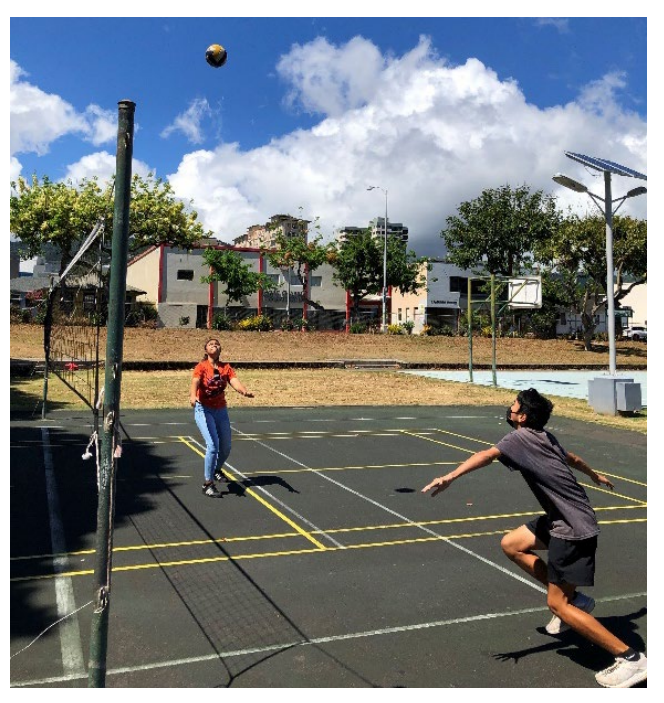
Volleyball is looking to repeat in ASAL, but it starts in the offseason.