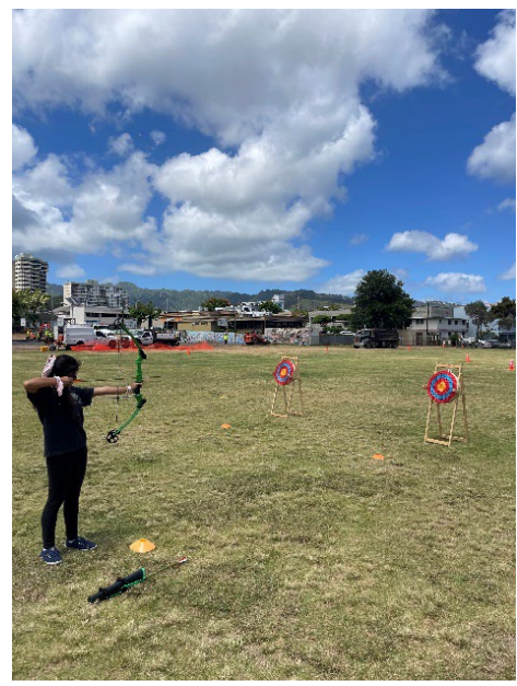
Students in Archery got to learn the in and outs of the bow before taking live shots at targets.