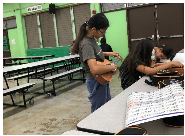
Ukulele Class continue to hone their tuning ears and practice their songs.