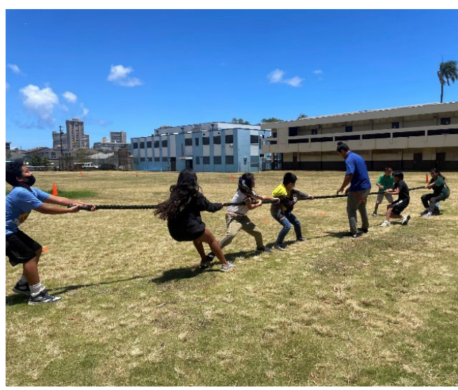
Students learned how to support each other (kuleana) and to work in unity (lokahi) as they played tug 'o' war.