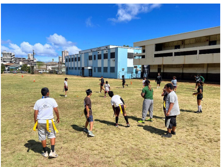
Football class practices the fundamentals and then put them into practice with game play.