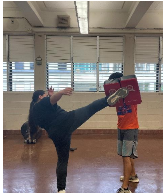
King All-Stars Self-Defense class learning how to stay consistent and build momentum by practicing their basic combos.