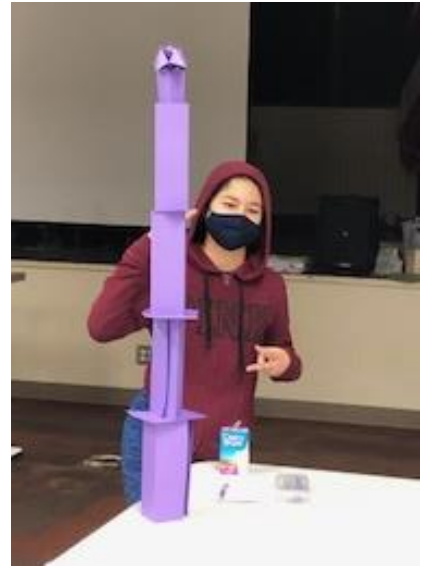
3 rd Place