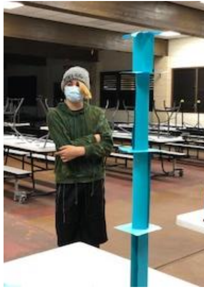
2 nd Place