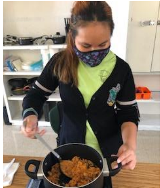
Students learn how to make a Puerto Rican dish, gandule rice, by adding meat, spices and vegetables to rice.