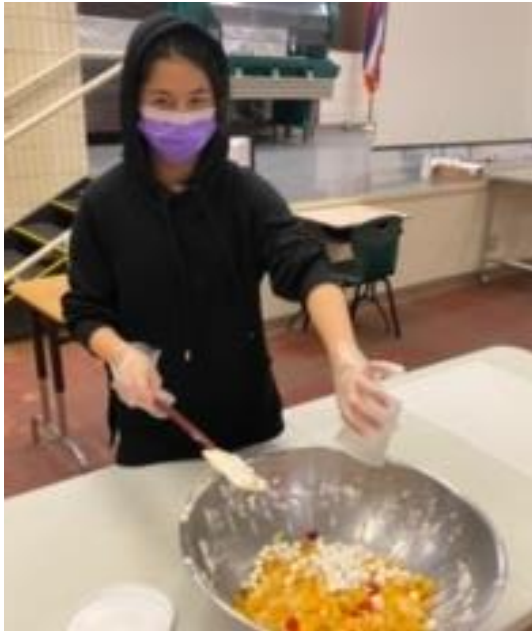
Students adding cream cheese, whipped cream and marshmallows to their fruit to make ambrosia